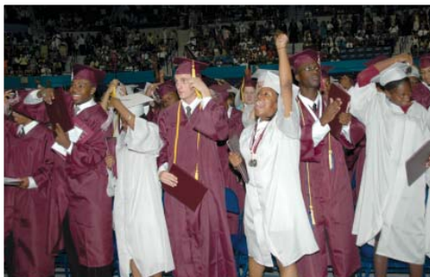
The class of 2008 earned more than $20 million in scholarships and grants from universities, colleges and military institutions across the country.

Careers in the 21st Century will require new skills and in-depth knowledge of new technologies. NNPS programs, like Career Pathways, help students build necessary career readiness skills, including speaking and listening; problem solving; initiative; and work ethic. From increasing enrollment in honors and Advanced Placement classes to Career Pathways internships and college dual-enrollment, Newport News Public Schools is committed to ensuring that all students graduate with the necessary knowledge and skills to be college-, career-, and citizenship-ready.