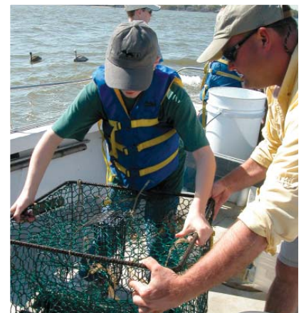
Students in marine science magnet program at B.T. Washington Middle take frequent boat trips.

Magnet programs and other offerings give Newport News families and students many choices for their educational experiences. Online classes are offered through NovaNET at all high schools. Students can receive college credit through Advanced Placement classes and dual-enrollment at Thomas Nelson Community College. This year, nearly 750 students are earning college credit through dual-enrollment programs.