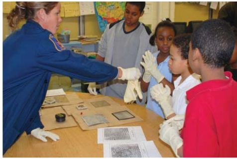
Carver Elementary students conduct an experiment with a crime scene investigator.

subjects and activities related to their selected pathway. NNPS partners with the Peninsula Council for Workforce Development and sponsors an interactive career preparation center at Patrick Henry Mall.