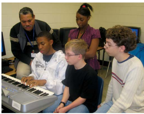
Huntington Middle students participate in the music technology club.