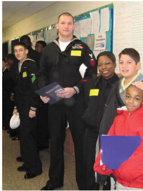
Sailors from the USS Bush with Newsome Park Elementary students.

More than 3,500 volunteers have given nearly 68,000 hours of service to NNPS. More than 300 local businesses and organizations have created partnerships with city schools; and 82 business partners have committed to lend their support and talents to Career Pathways by providing worksite opportunities, job shadowing, club/activity sponsorships, internships and speaking engagements.