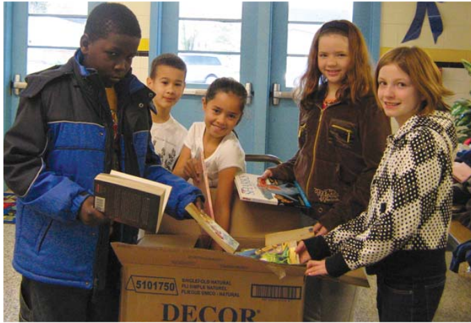
Sanford Elementary students collected over 500 books for disadvantaged youth.

NNPS established the Youth Development initiative to help students feel connected and part of their school through involvement in leadership opportunities, club activities, and other extracurricular programs. Seventy elementary school students and 52 middle and high school students were recently honored for their leadership, citizenship and community initiatives. More than half of all NNPS students are engaged in clubs, activities and athletics. This year, the school division launched a middle school sports program with over 500 students participating.