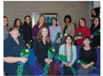
The school division's newest National Board Certified teachers.

curriculum integration specialists are certified in the National Educational Technology Standards for Teachers. Ninety-three percent of NNPS teachers are designated as highly qualified by federal No Child Left Behind standards.